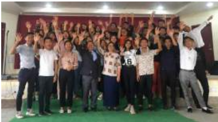
EU spiritual Awakening