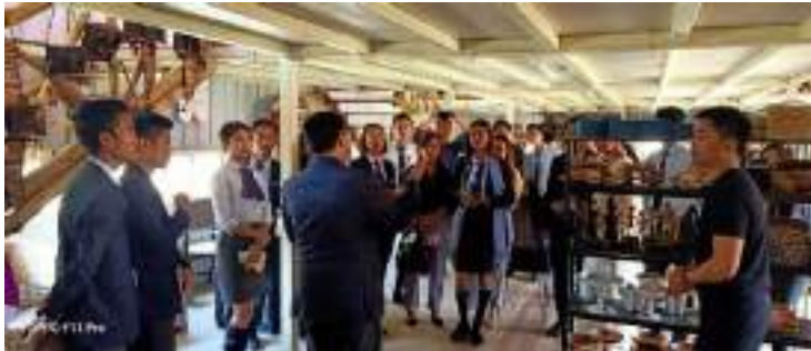
BBA Industrial Trip