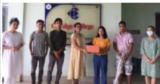
Farewell Gift to college by class of 2020