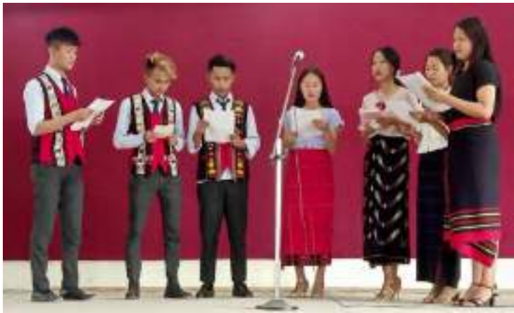
International mother language day