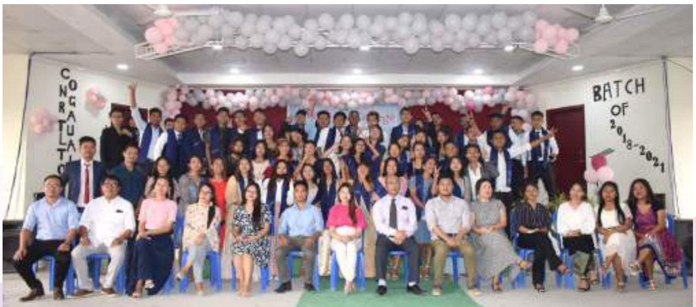
Graduating Class of 2021 with Commencement Speaker and Faculty members.