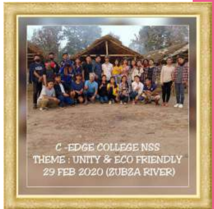
C - EDGE COLLEGE NSS THEME : UNITY & ECO FRIENDLY 29 FEB 2020 (ZUBZA RIVER)