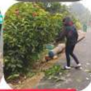
Katharizo Day: FORERUNNER. Date-01/02/2020