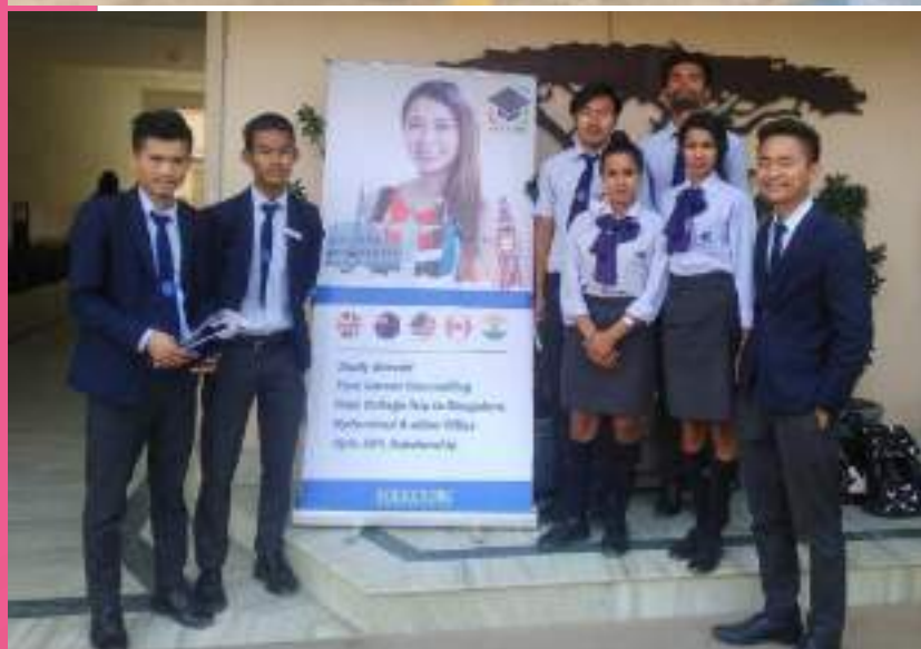
Edu care expo