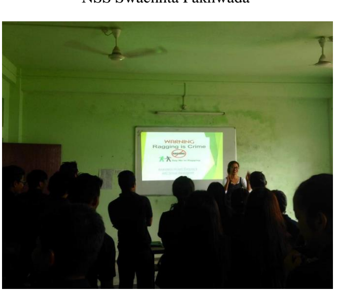
Talk on Anti-Ragging