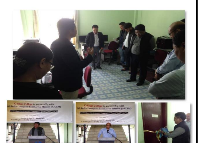
Launching of DCA Programme