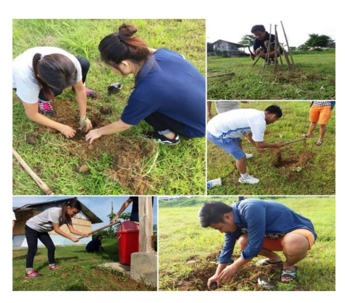
NSS Plantation Drive