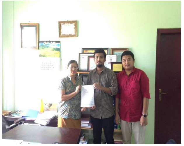
MoU with AICSM