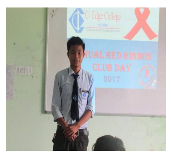
Red Ribbon Club Day