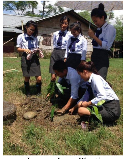
Legacy Lane Planting