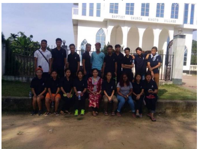
NSS Extension Service (Nihoto Village)