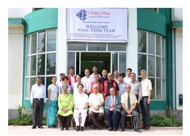
NAAC Peer Team Visit