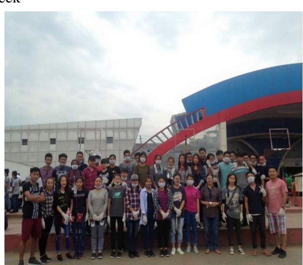
Himalayan Clean Up Project