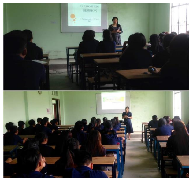
Grooming Session for Freshers