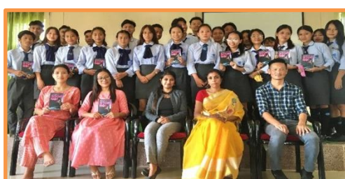
Book Reading – English Dept.