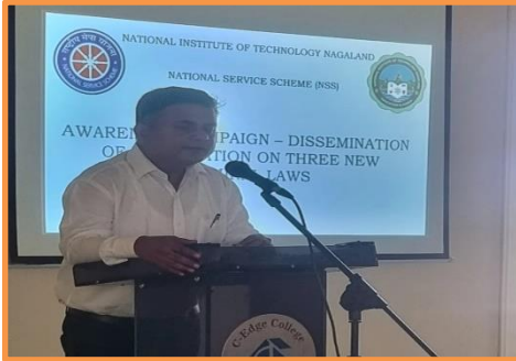
Indian Penal Code Awareness Talk