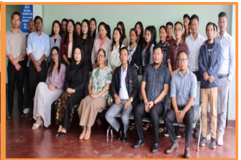
Faculty & Staff Development 2024