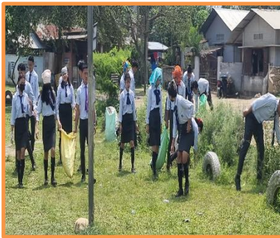
NSS Community Outreach