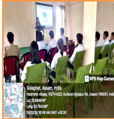
World Consumer Day