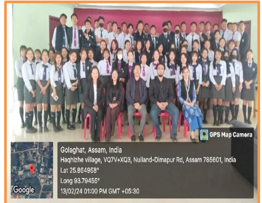
Career Guidance by Mahendra Coaching