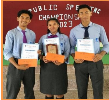
Winners of PSC