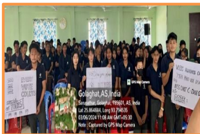
Voters Right Awareness