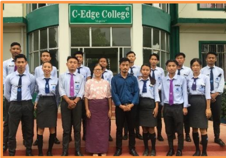
CEC SF 2023-24