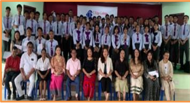
World Entrepreneurs Day & the Winners of The Entrepreneur 2023