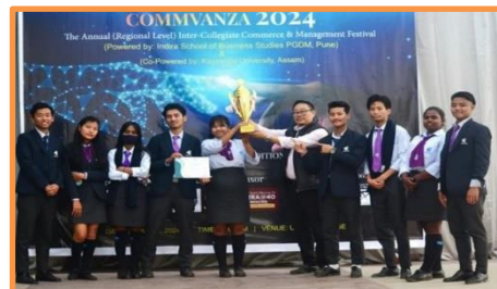
Champion – Commvanza 2024