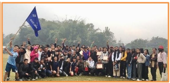
Annual Sports Meet 2024