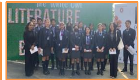
Nagaland Literature Event