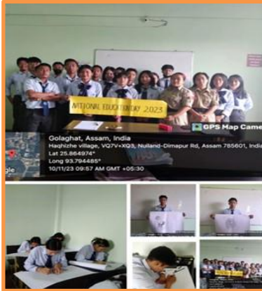
National Education Day