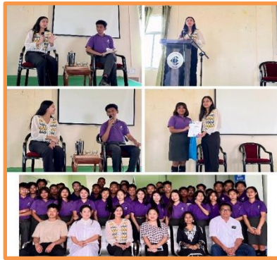
Alumni Interface 2024 -BBA