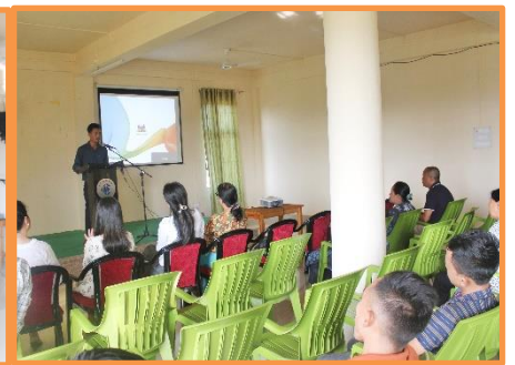
Parent Teacher Guardian Conference (PTGC) 2023