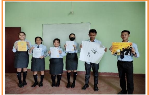
World Suicide Prevention Day