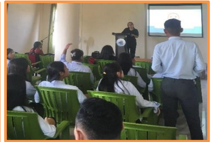
Special Lecture Series