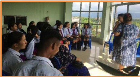
NTTC Skill Training