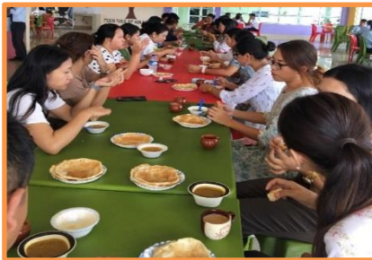
Teacher Day Treat 2023