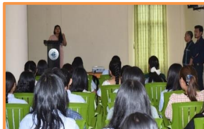
First Semester Orientation