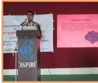
Cyber Security Workshop