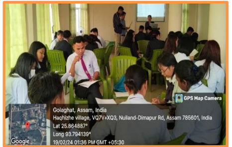
Research Methodology Workshop