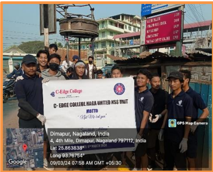
NSS Cleanliness Drive