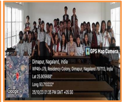
Faculty Exchange -Unity College