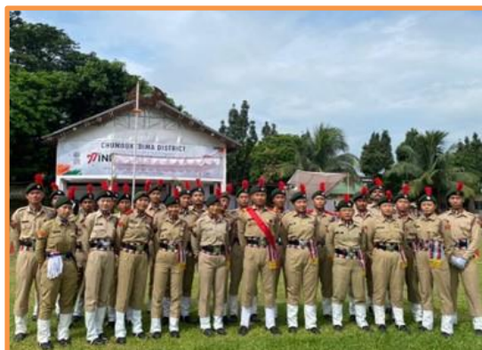
NCC after Independence Day parade