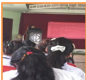
Orientation on FYUGP