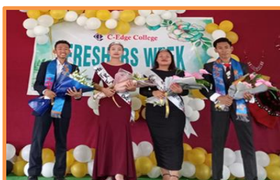
Mr. & Ms Freshers 2023