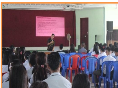
Waste Management Workshop