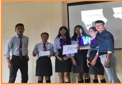
Winners of Business Quiz