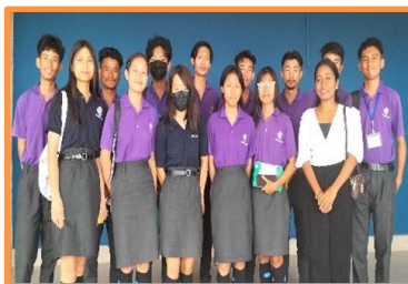
YI Event participation