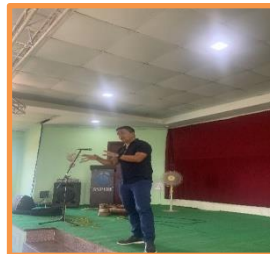
NBCC Youth Ministry