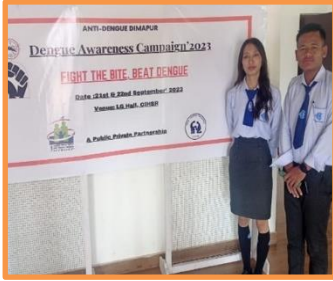
Dengue Awareness Prog.