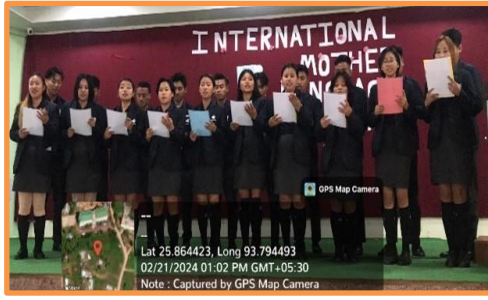
International Mother Language Day