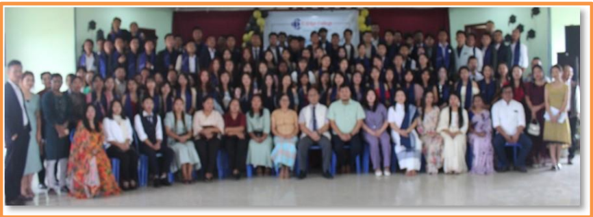
Commencement Day 2024