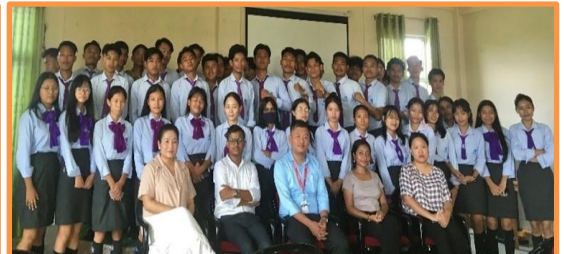
Alumni Interface 2023 – BBA