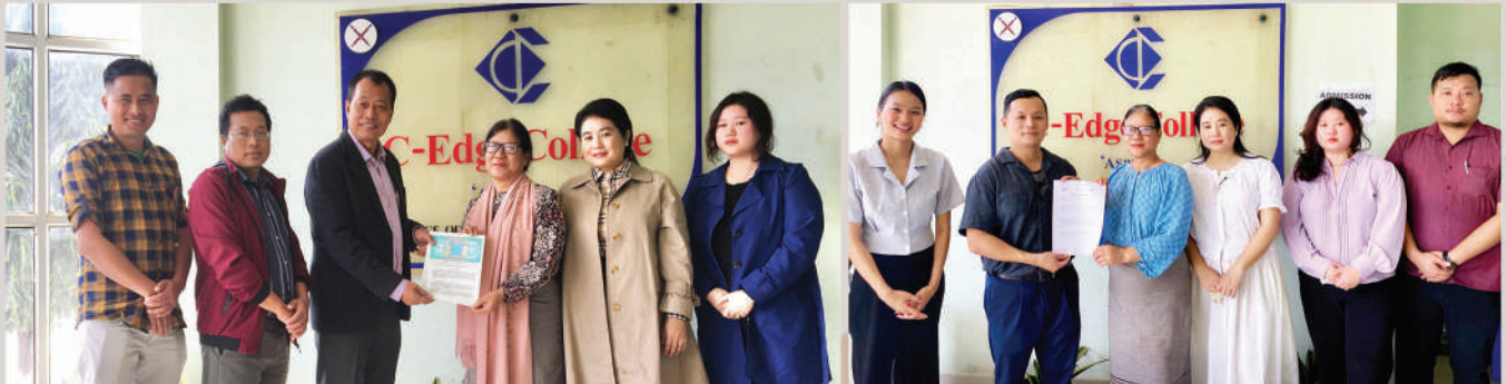
Signing of MOU between C-EDGE College & Life Ministry Learning Centre 2024