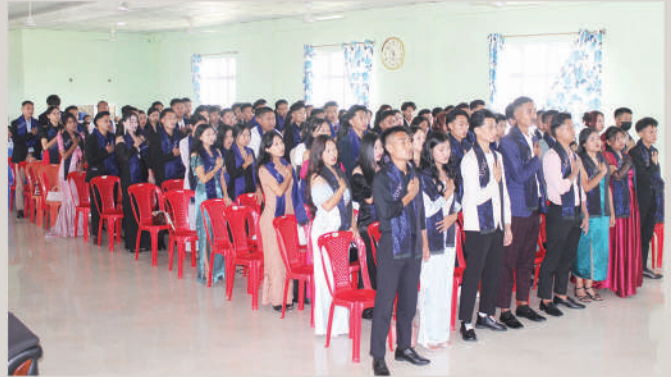
10 th Commencement Day