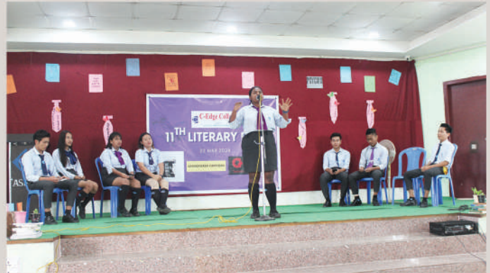
11th Literary Day