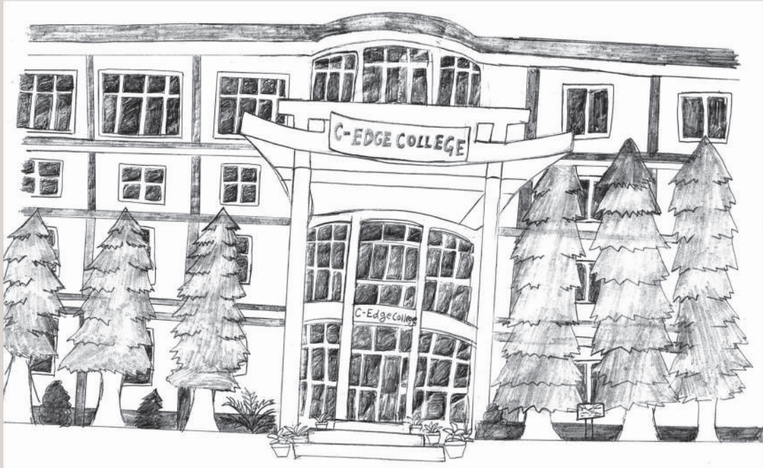
Chubanungsang Imsong, BA V