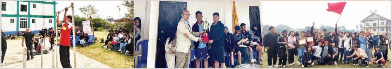
12 th Annual Sports Meet