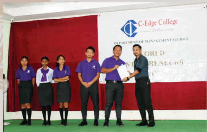
Team Hains Enterprise - Winners of The Entrepreneur 2024