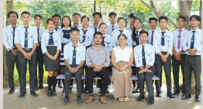
C-EC Students Forum 2024-2025