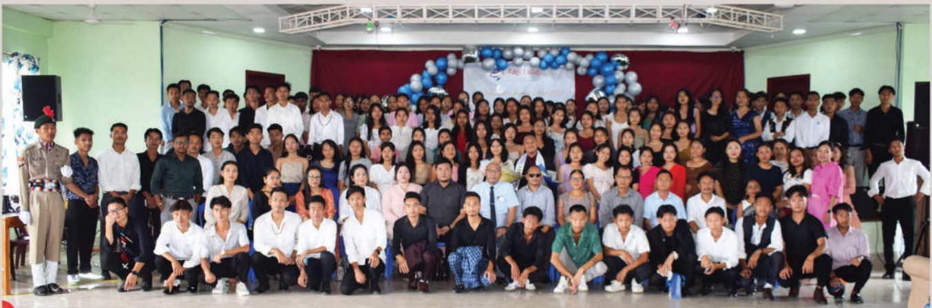
12 th Annual Freshers Week