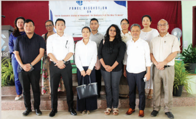
Inauguration of 24 KW solar power plant 2024