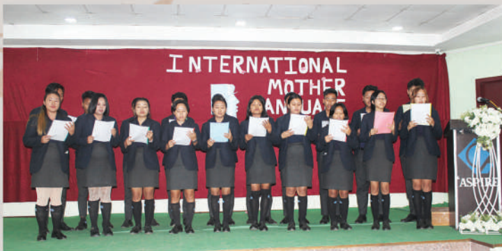
Commemoration of International Mother Language Day 2024