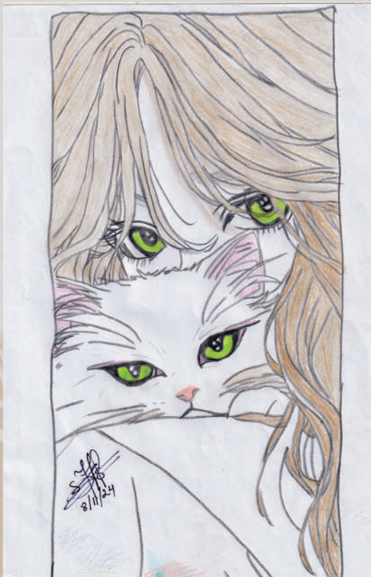
C. Singyimchu, BA III