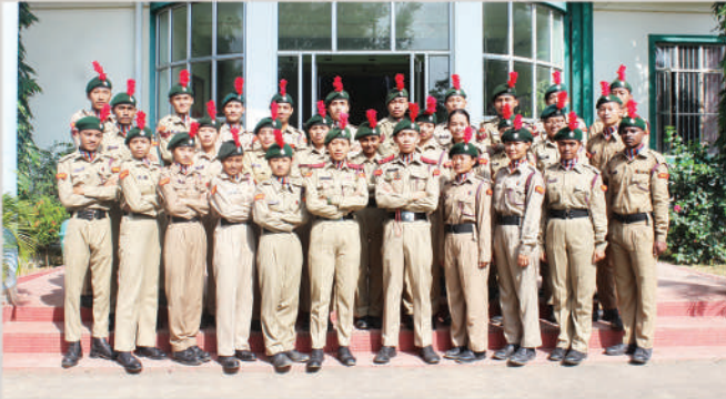
NCC 25 th NL BN