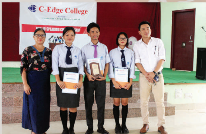
Winners of Public Speaking Championship