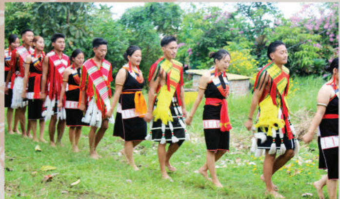
11 th Fine Arts & Cultural Day