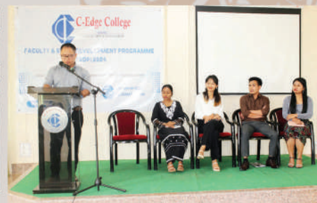
Faculty & Staff Development Programme 2024