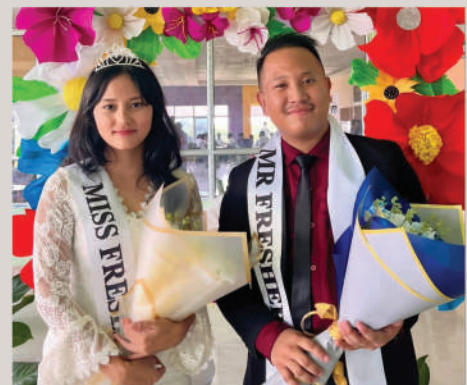
Mr. & Ms. Fresher 2024