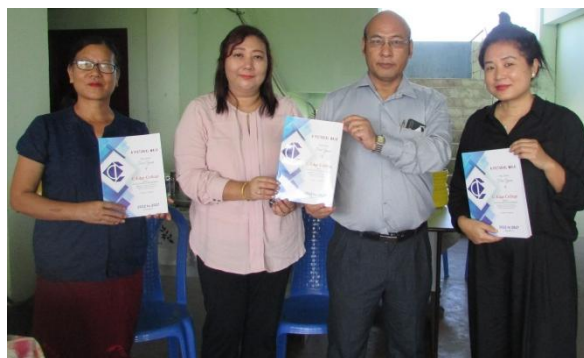
Release of 5 years of CEC Pictorial Book