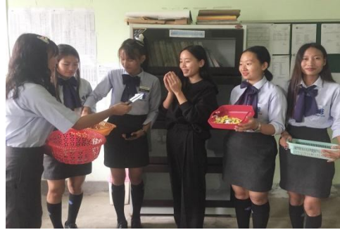
International Women's Day Celebration