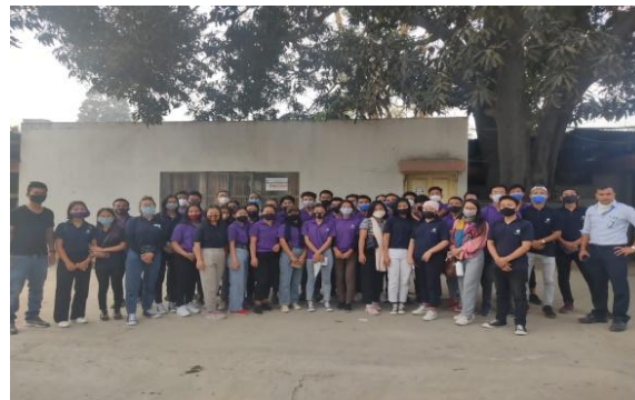
Industrial Visit - BBA & Economics Dept