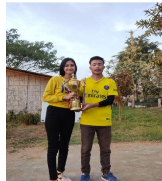
ANNUAL SPORTS MEET 2020