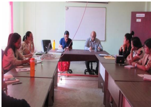
100 Faculty Review Meeting