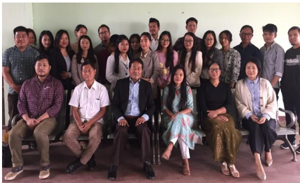
Faculty & Staff Development Program